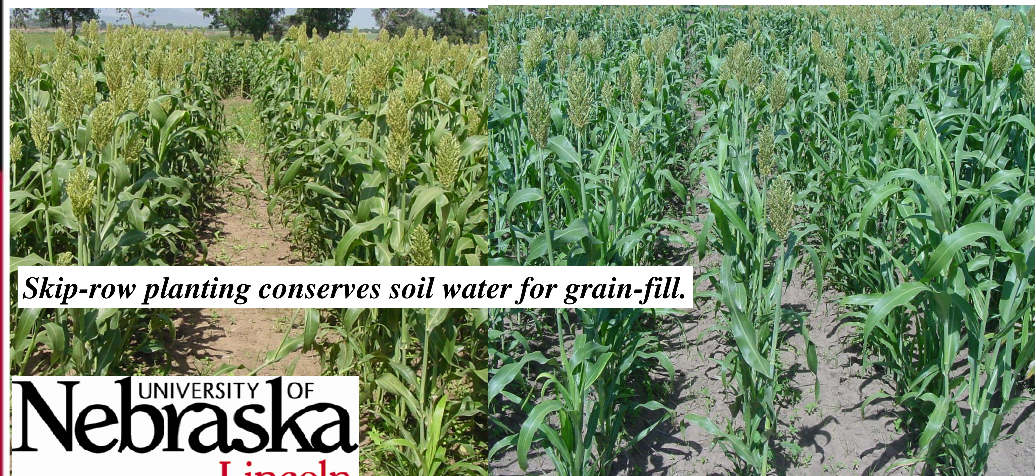
Skip-row planting conserves soil water for grain-fill.

Skip-row planting and tie-ridging: Eight trials were conducted in northern and central Ethiopia as complete factorials. The skip-row treatments were: no skipped rows (S0); one planted alternated with one skipped row (S1:1); two planted alternated with two skipped rows (S2:2); and two planted alternated with one skipped row (S2:1). The tillage treatments were flat tillage and tie-ridging. Grain yields and harvest indexes were generally low. Treatment effects were not significant at two locations in central Ethiopia. Yield was increased by 19% with S2:1 planting and by 93% with tie-ridging compared with flat tillage in the north where yield was relatively low (Fig. 2).