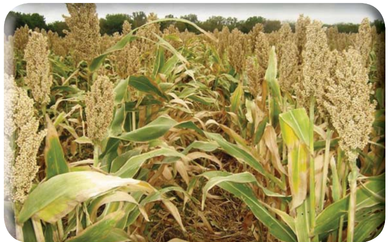
Variety INTA-RCV produces an excellent quality sorghum flour which can be substituted in part for wheat flour, thus reducing the amount of imported wheat.

Nicaragua has made great strides in sorghum production through their participation in the PCCMCA sorghum testing program. A strong collaborative relationship exists between the INTSORMIL regional research program and INTA, the Nicaraguan national agricultural research program, and ANPROSOR, the Nicaraguan grain producers association. On April 30, 2008 the INTA sorghum program released three new sorghums; (1) Variety INTA-RCV, (2) Variety INTA SR-16, and (3) Hybrid INTA Forrajero. All have outstanding qualities and each targets a different market. The varieties RCV and SR-16 provide small producers with access to improved genetics without the cost of hybrid seed while the INTA Forrajero is a forage hybrid with high yield potential.