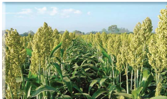
Sorghum variety Soberano in evaluation trials in Nicaragua.

In summary, this regional testing program contributes to the achievement of the INTSORMIL/PCCMCA/CENTA/INTA collaborative goal of "Improving sorghum production and quality in Central America."