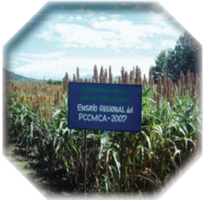
Central America Regional sorghum evaluation trial in Nicaragua

Nicaragua has made great strides in sorghum production through participation in the Central American testing program.